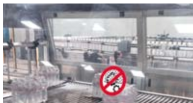
INSTALLATION / Et Bahouara