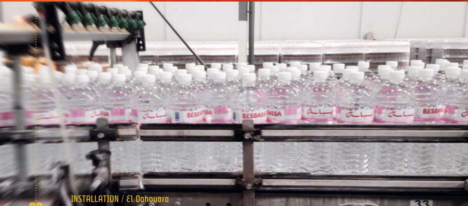
INSTALLATION / El Dahouara

technologies that offer the highest level of product purity, safety and hygiene. As such, from the supply viewpoint, the investment in industrial high-tech systems is an obvious choice to expand market share and product range, offering increasingly conscious and demanding consumers products having higher and higher quality standards.