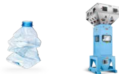
EXTREME BLENDING FLEXIBILITY