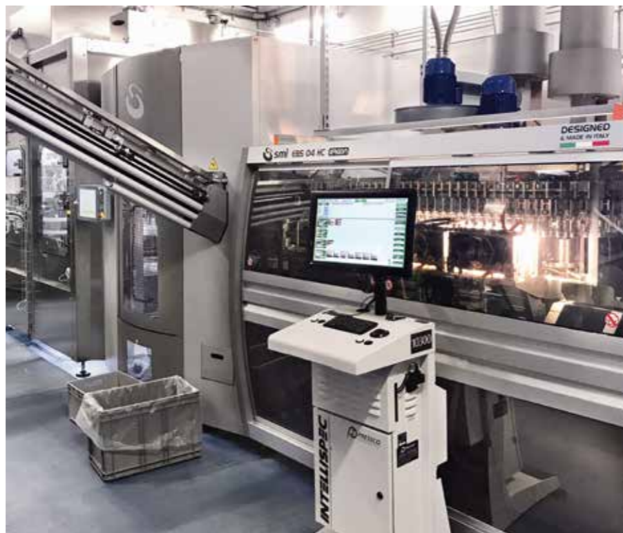
Fig 3: To satisfy the quality standards of the Danone group, the ECOBLOC® HC ERGON supplied by SMI, is equipped with sophisticated Pressco inspection systems

the Evian, Volvic, Badoit and Salvetat brands, and it is already thinking about bottling them in rPET made from 100% recycled plastic.