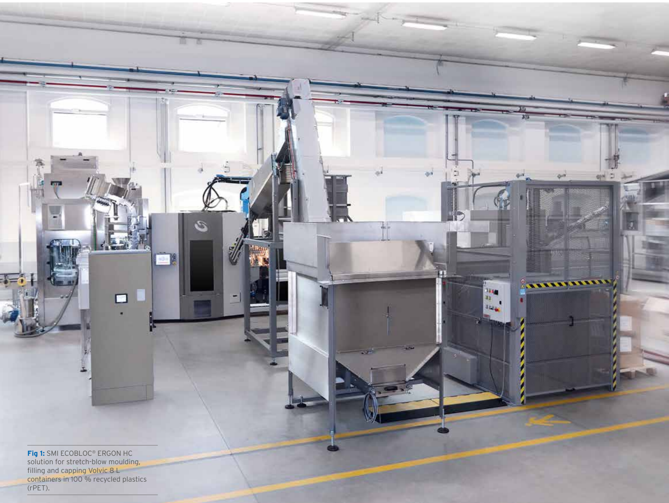
Fig 1: SMI ECOBLOC® ERGON HC solution for stretch-blow moulding, filling and capping Volvic 8 L containers in 100 % recycled plastics (rPET).