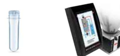
MOISTURE CONTENT CONTROL