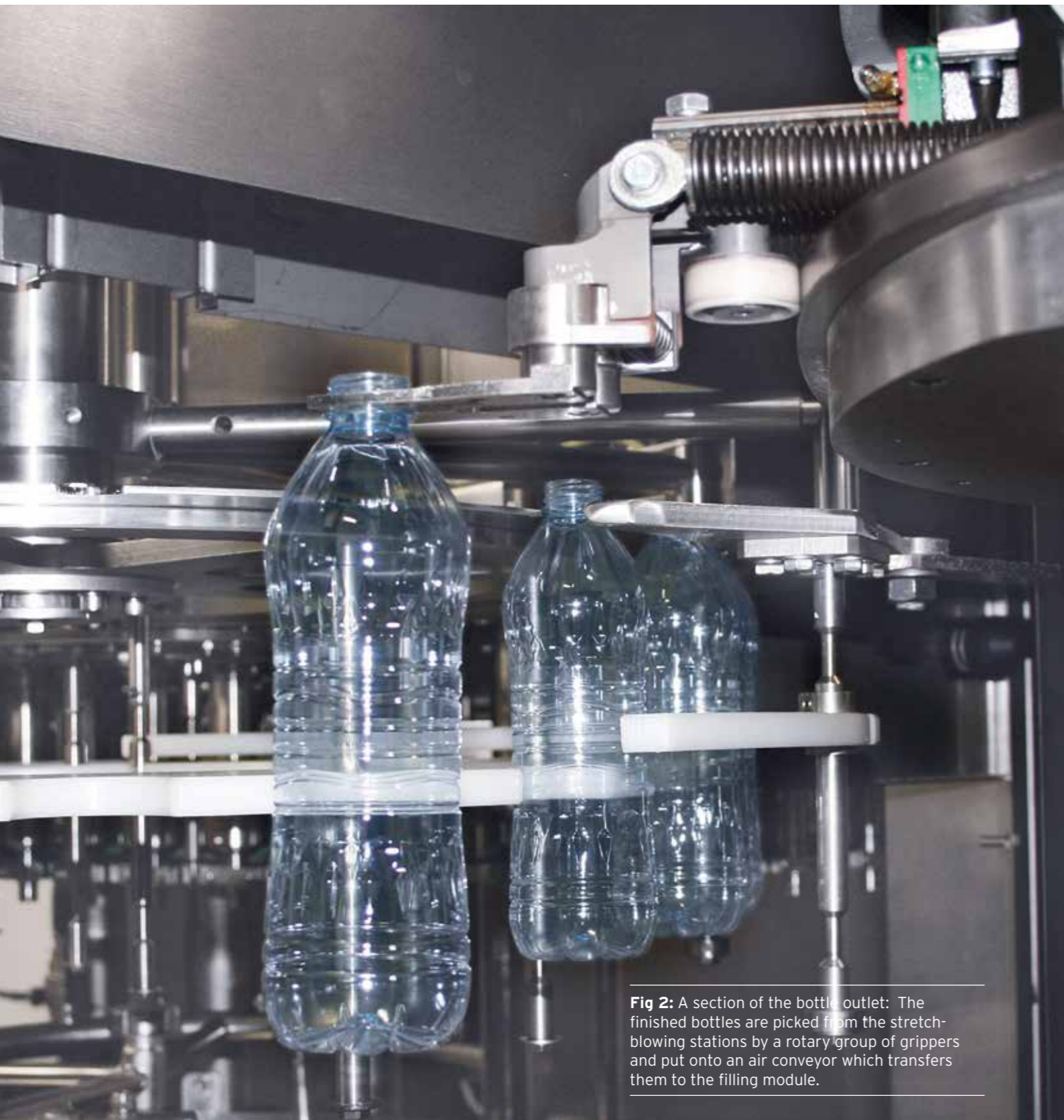
Fig 2: A section of the bottle outlet: The finished bottles are picked from the stretch-blowing stations by a rotary group of grippers and put onto an air conveyor which transfers them to the filling module.

Companies in the food and beverage industry are reviewing their production processes to make them as eco-sustainable and competitive as possible by making use of “smart and green” technologies of industrial automation and recyclable and biodegradable packaging. The sustainability of entrepreneurial activity is a demanding and strategic choice, made up of large and small objectives that are achievable thanks to a particular cultural attitude and continual investments, in new plants equipped with IoT (Internet of Things) technology, that allow the machinery to improve and adapt independently to the new production requirements of the XXI century.