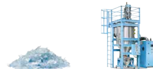
BOTTLE TO BOTTLE RECOVERY